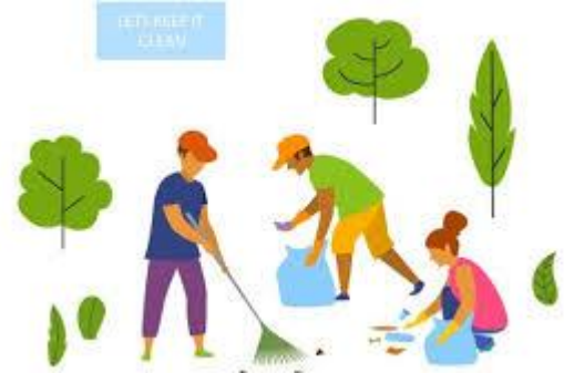
Van Cortlandt Park Clean Up