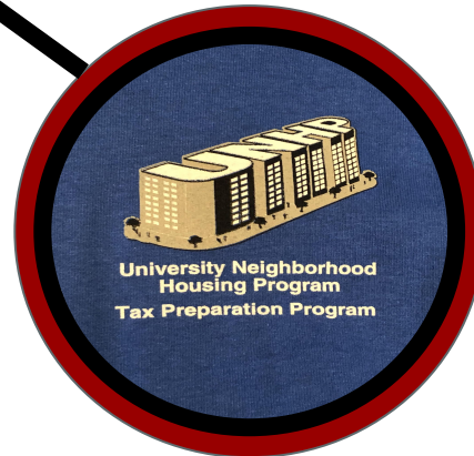
University Neighborhood Housing Program Tax Preparation Program