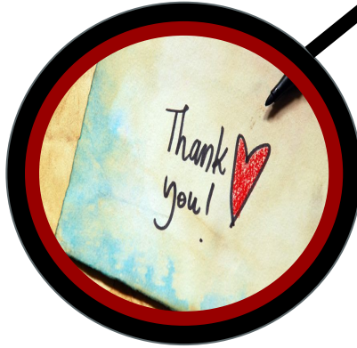
Letters to Veterans