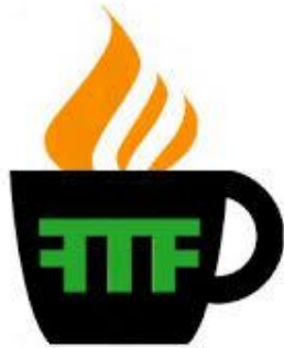
Fair Trade Fuel

Our In-Person community service events allow our members and candidates to continue to uphold our traditions in a socially distanced setting. These activities have been restructured to assist the community where they need the most.