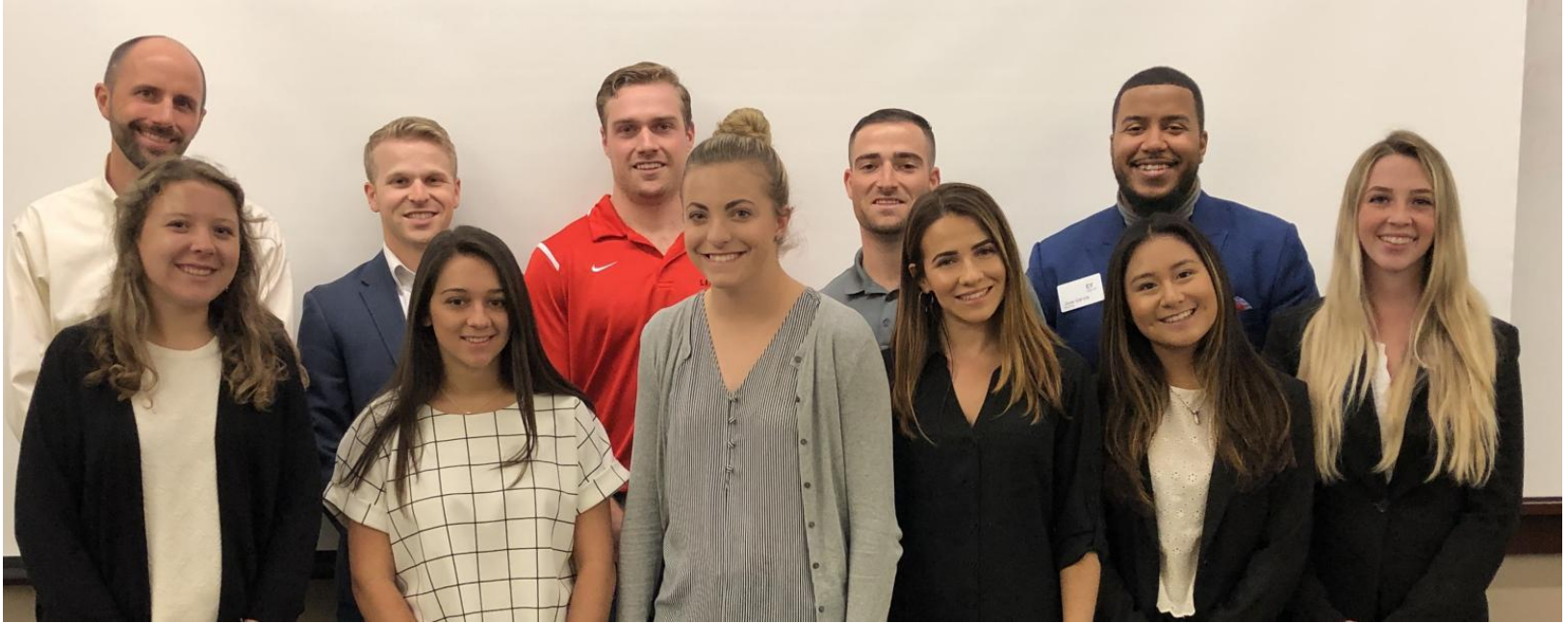
Marist College Beta Alpha Psi Board pictured with EY alumni - October 2019